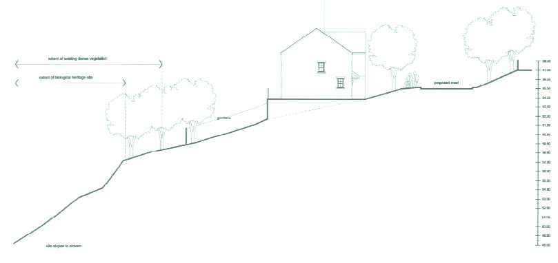
SITE SECTION BB - 1:200